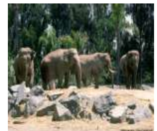
Welcome to the Jungle Homecoming 2009

Paris Cooperative High School is a learning community dedicated to developing well-educated, productive, engaged citizens in a respectful, safe, supportive environment.