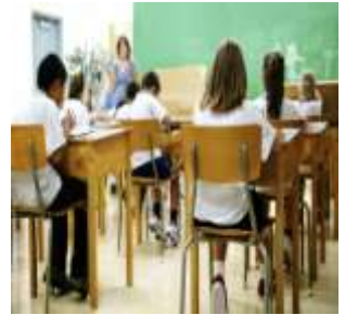
Open house 2009 was a booming success.

Overall, it seems that the open house was well received, and PCHS staff members were thrilled to have so many visitors from the community. Thank you for making open house such a positive event.